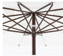
2" Reinforced Ribs