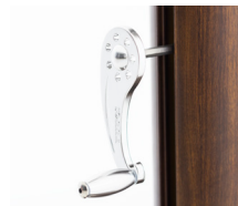
Telescoping Mast with EasyDrive Crank Lift System