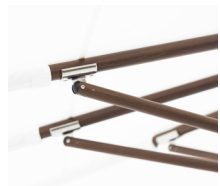
Reinforced Strut Joint Connector