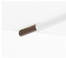
Screw Pocket Construction